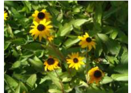
Left: Flourishing Joe Pye weed in the Labyrinth surround. Above: black-eyed Susan on east side of the Labyrinth walkway.