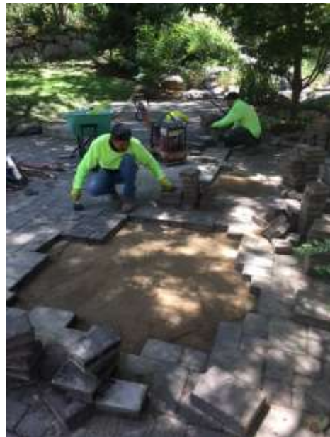
Above and right: The Honey's Garden paving projects in progress.