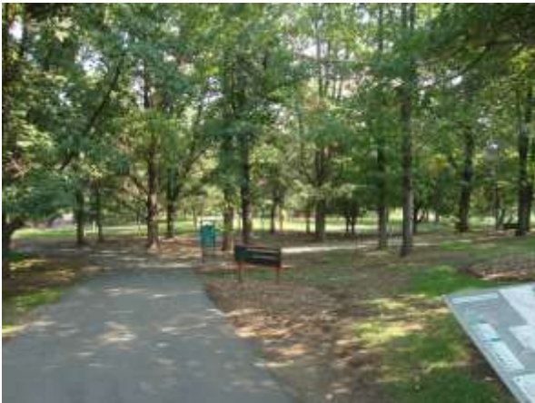
Above: View of Kleiner's Oak Grove as you enter the Arboretum by the South Entrance

Our skies have been filled with thick smoke, sometimes so thick that you can't see a block down the street. A short walk in Kleiner's will spirit you away from all of that, at least for a short while, anyway.