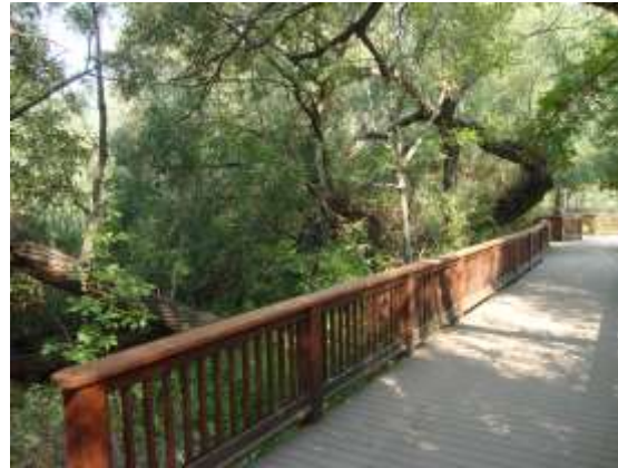
The bridge looking towards the Northwest.