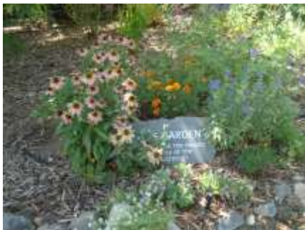
Above: A garden within a garden by the Labyrinth path, full of coneflower, marigolds, sweet allysum, and some caryopteris.

Keeping the winding path of meditation stones in the Labyrinth weed free is no easy feat. It always looks lovely when I walk the path for some head clearing time. The well tended plantings that encircle the garden add to the quietness and privacy.