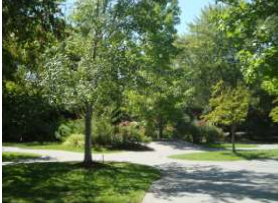
Above: Looking west into Dixie's Plaza Garden.

Dixie's Plaza Garden is a gentle welcome to visitors entering the Arboretum from the Southwest gate.