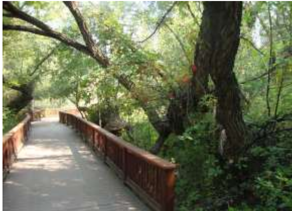
Evans Creek Bridge view facing Northeast.

The bridge across Evans Creek is even more hauntingly beautiful now that so much of that invasive teasel has been removed by our Volunteers.