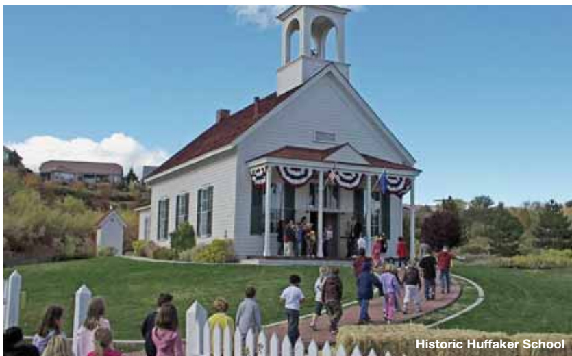
Historic Huffaker School

6000 BARTLEY RANCH ROAD, RENO • 775-828-6612