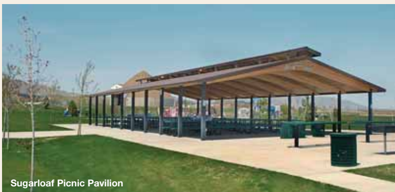
Sugarloaf Picnic Pavilion