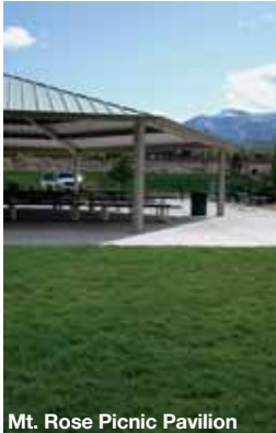
Mt. Rose Picnic Pavilion

15650 WEDGE PARKWAY, RENO • 775-849-1825