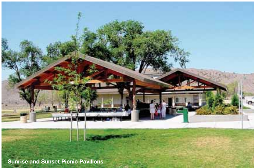
Sunrise and Sunset Picnic Pavilions

7100 PYRAMID LAKE HIGHWAY, SPANISH SPRINGS • 775-424-1866