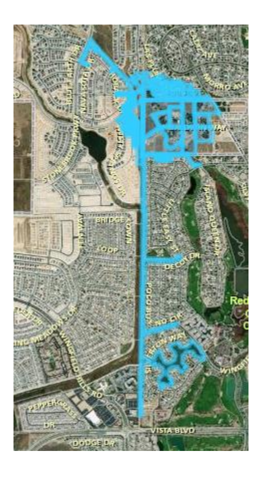
Public Notice Map Case Number WADMIN23-0012

Washoe County Code requires that public notification for a special use permit must be mailed to a minimum of 30 separate property owners within a minimum 500-foot radius of the subject property a minimum of 10 days prior to the public hearing date. A notice setting forth the time, place, purpose of hearing, a description of the request and the land involved was sent within a 680-foot radius of the subject property. A total of 40 separate property owners were noticed a minimum of 10 days prior to the public hearing date.