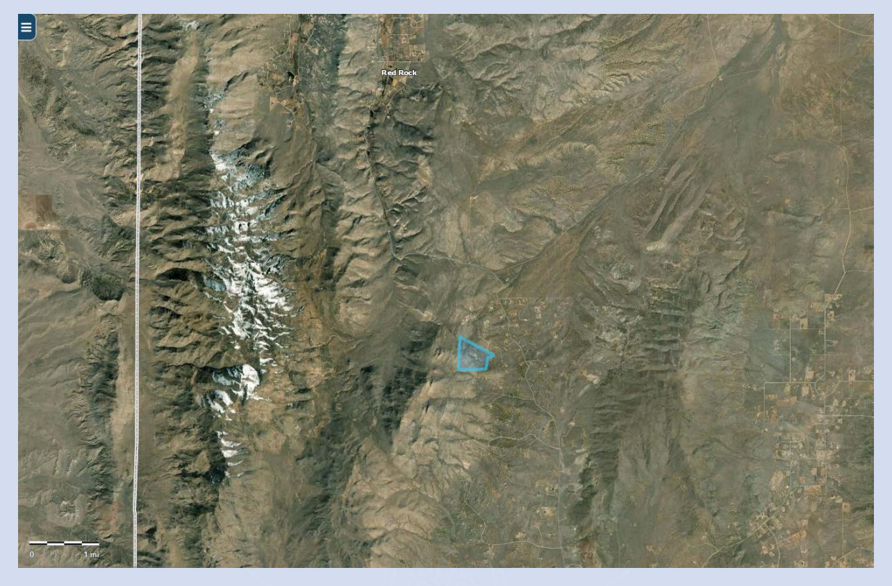
Washoe County Board of Adjustment May 6, 2021