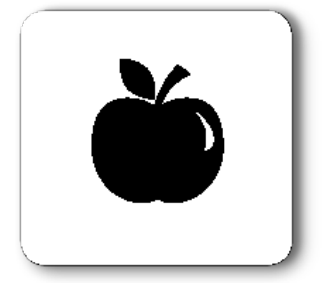
Access health information (tools & videos)