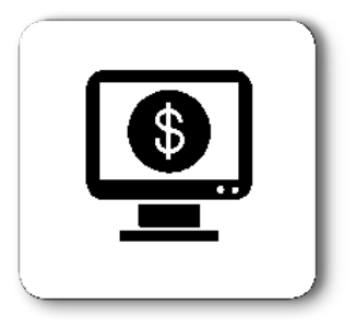
Reporting and Analytics