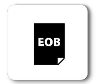
Member help when and how they need it

EXPERIENCE of having the honor of serving Nevada residents for over 30 years