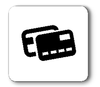
One ID Card for all Benefits