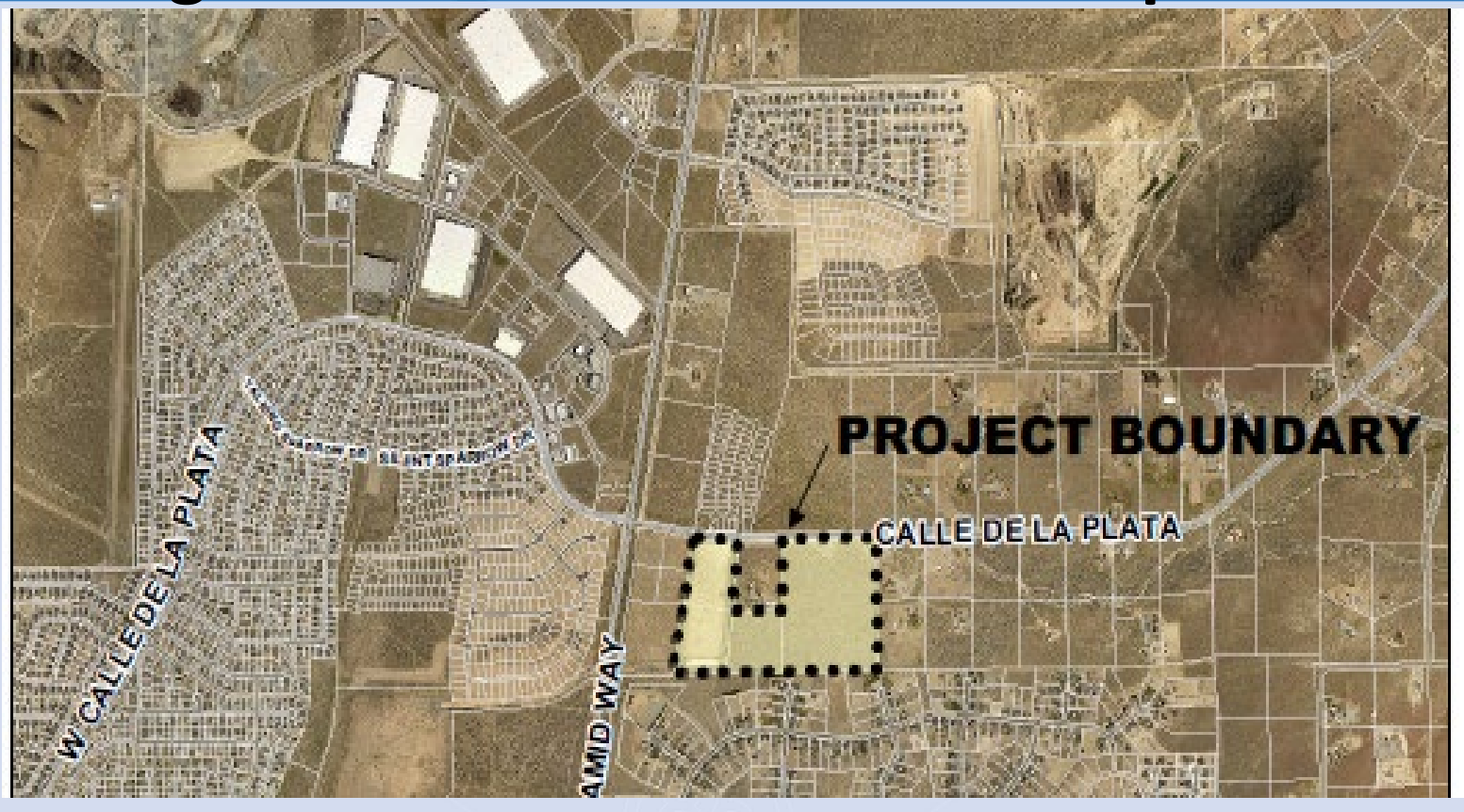
Board of County Commissioners December 14, 2021

Village Green Commerce Center Specific Plan