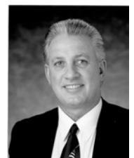
Jim Shaw, Chairman Washoe County Commissioner

“I am proud to represent the City of Sparks on the District Board of Health. I encourage all citizens to support the District Health Department’s valuable public health programs, designed to promote health, prevent disease and protect the public and the environment.”