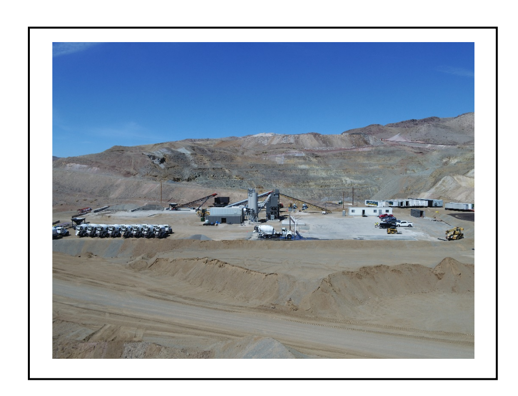
Photograph 4: View of SSC Plant looking Northwest.