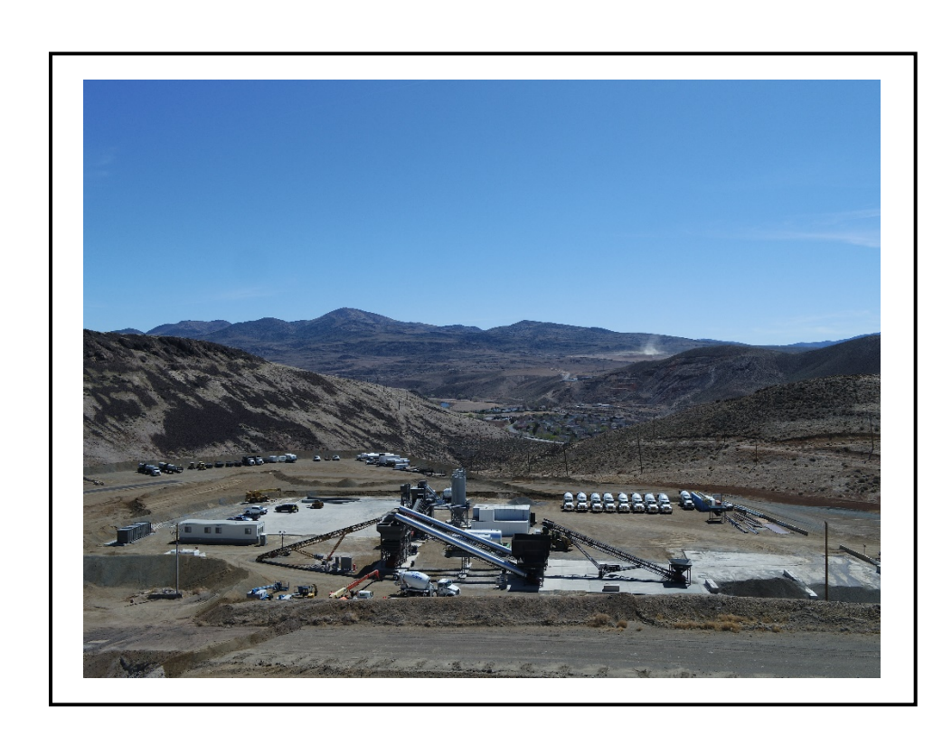
Photograph 1: View of SSC Plant looking Southeast.