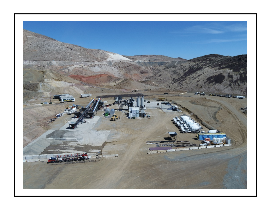
Photograph 3: View of SSC Plant looking Northeast.