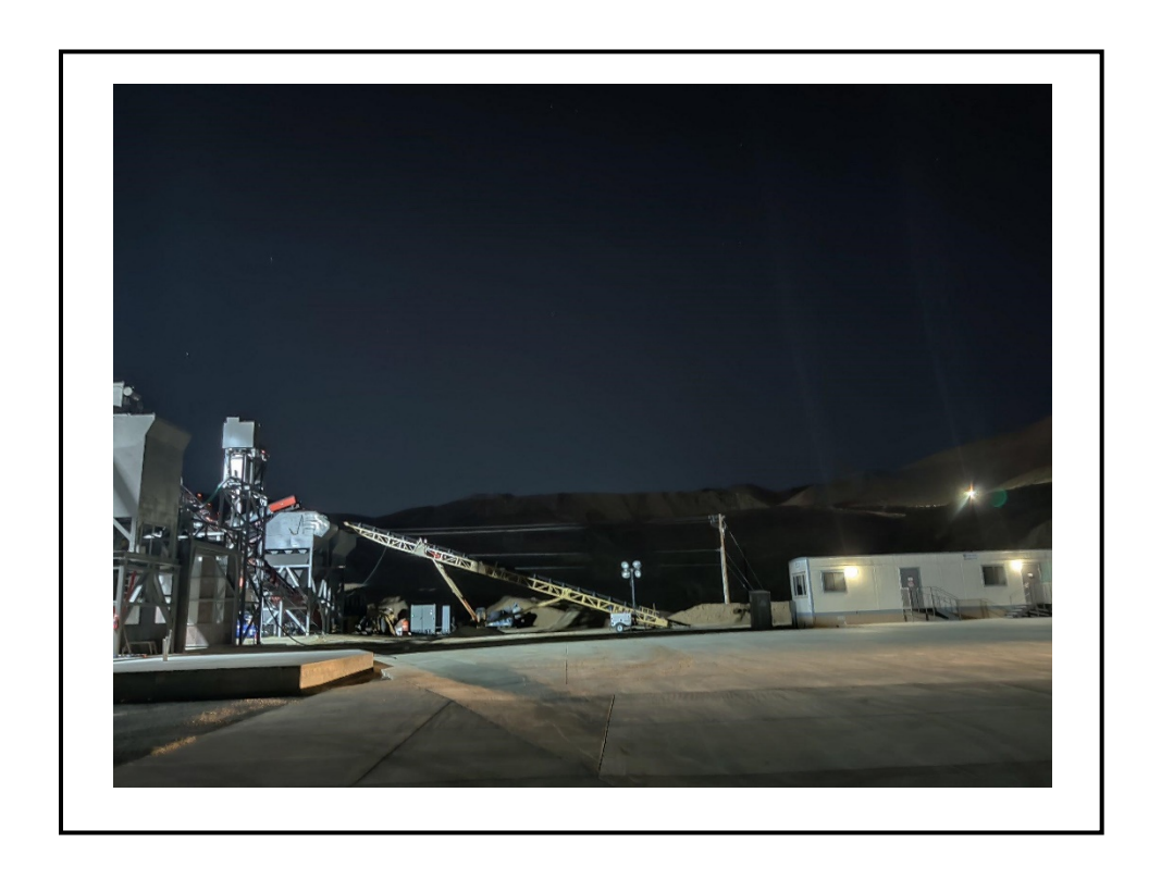
Photograph 6: View of SSC and office lighting looking West.