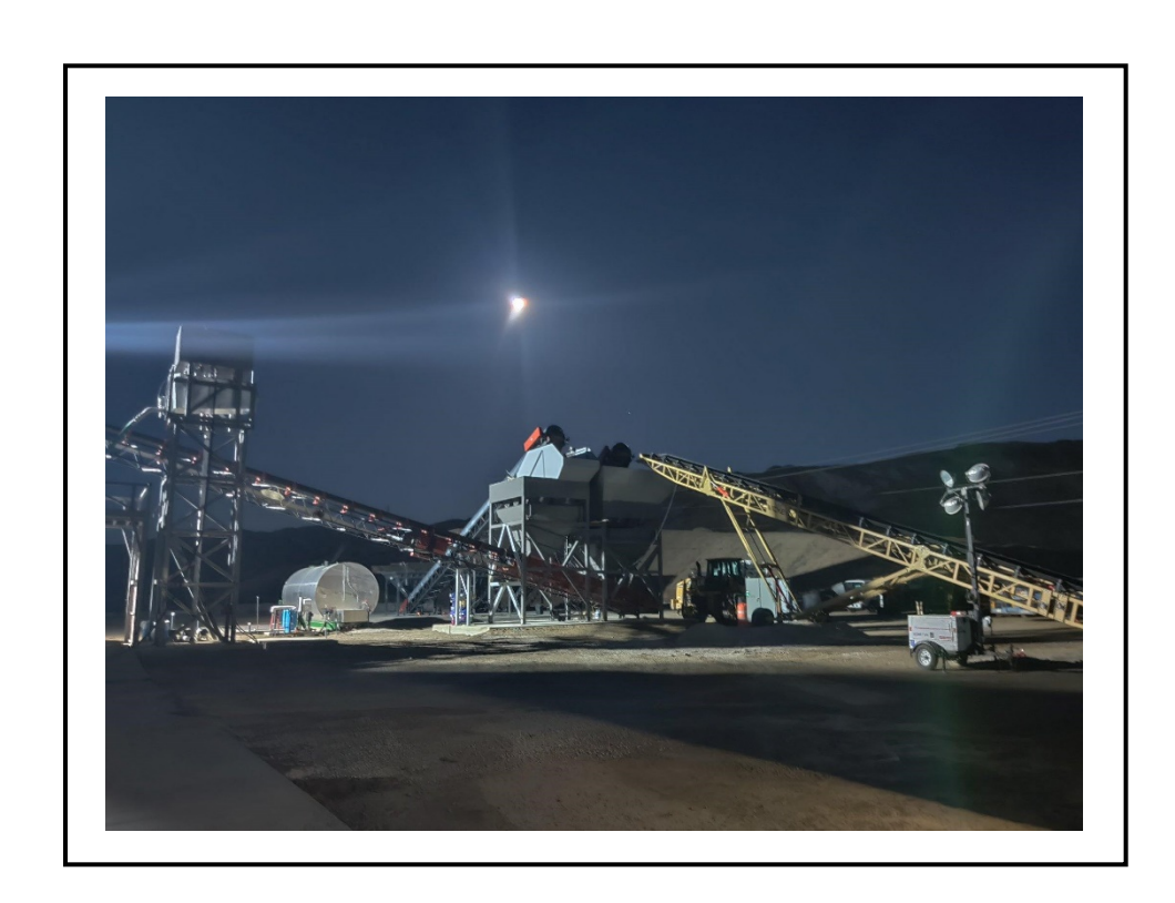
Photograph 5: View of SSC Plant lighting looking South.