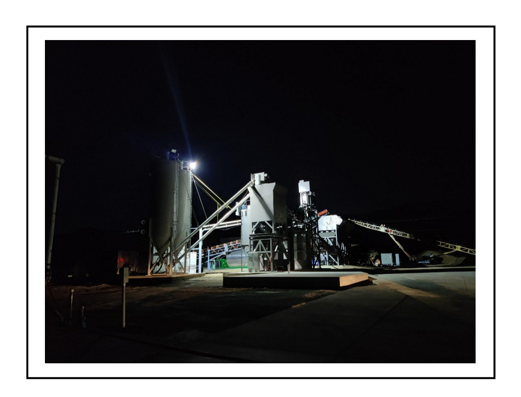
Photograph 7: View of SSC Plant lighting looking North.