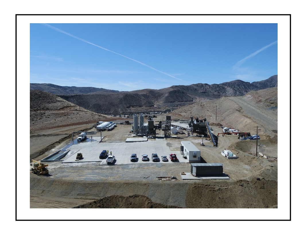
Photograph 2: View of SSC Plant looking Southwest.