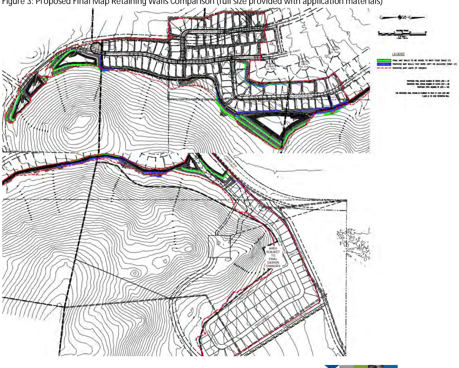
Figure 3: Proposed Final Map Retaining Walls Comparison (full size provided with application materials)